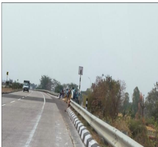
Image: Due to lack of waiting area, students have to wait on the highway(NH-69)