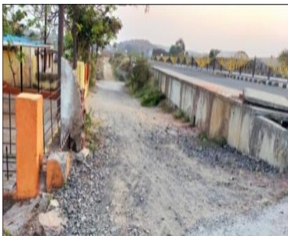
Image: Poorly constructed service roads